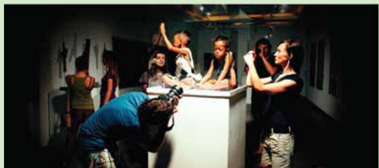
Illustration 3 Children are not tourist attraction.

Movements form from non-violent social change groups when the group gains momentum and begins attracting large numbers of people and expands their agenda beyond a few objectives into changing larger institutions, norms, culture, and organization.