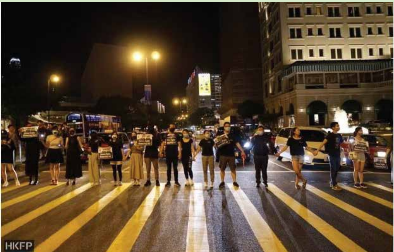
Illustration 4 Hong Kong, Human chain inspired by Baltic Way