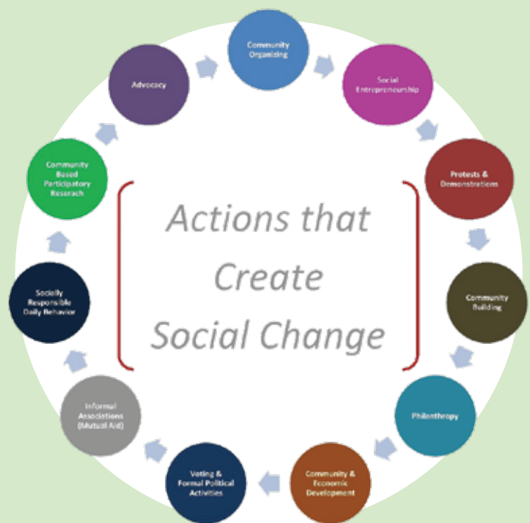
Illustration 3 Social Change Wheel. Source: University of Alabama