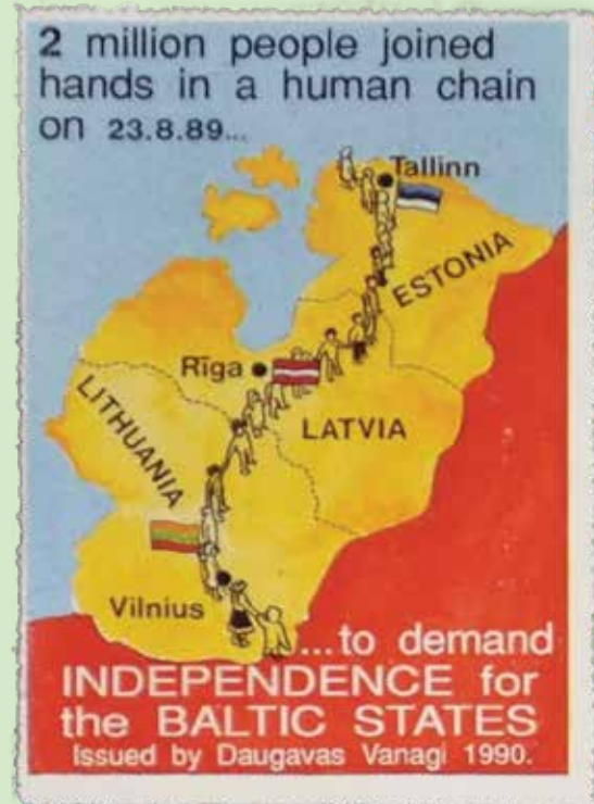
Illustration 4 Baltic Way

The goal of non-violent strategies is to change attitudes, beliefs, values, behaviours, and to stop injustices and violence.